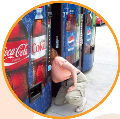
better be the real thing back there