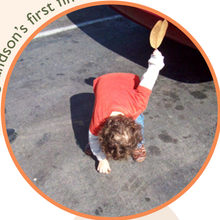
grandson's first find