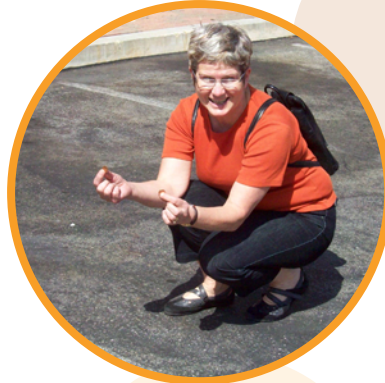
aussies can do this two