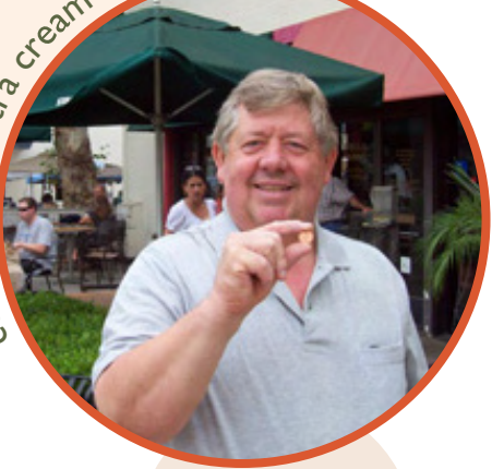
coffee with extra cream and coin, please