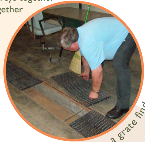
a grate find