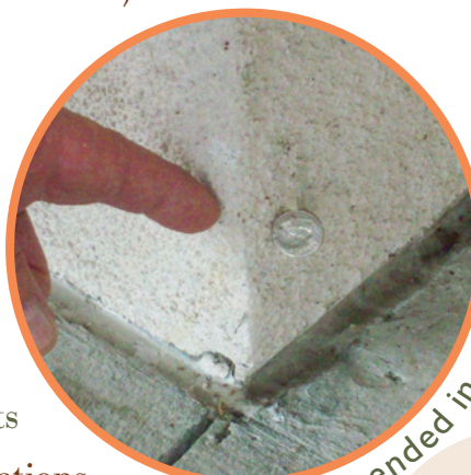
safely suspended in a spider web