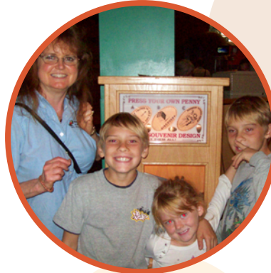
the family that preys together stays together