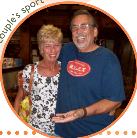
a couple's sport