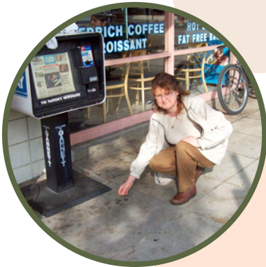
breaking news: tina finds a penny