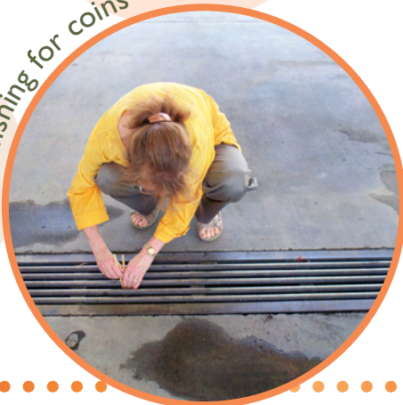
fishing for coins