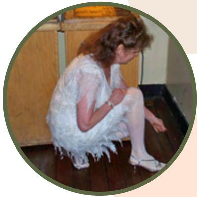
formal night finding at the queen mary