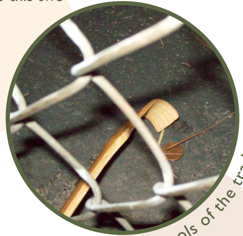
tools of the trade